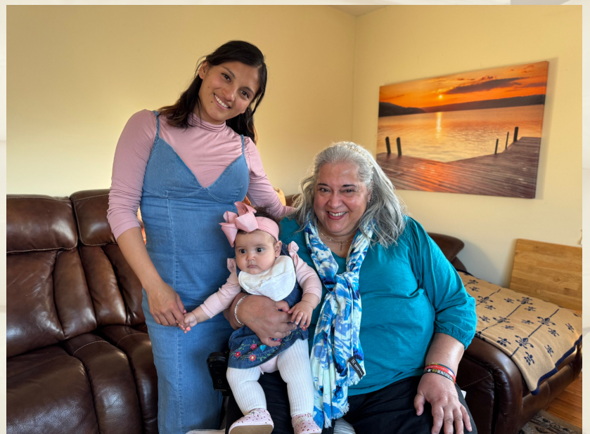
Interviews & Client Testimonies