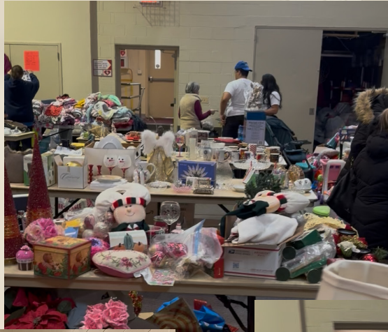
Annual Flea Market