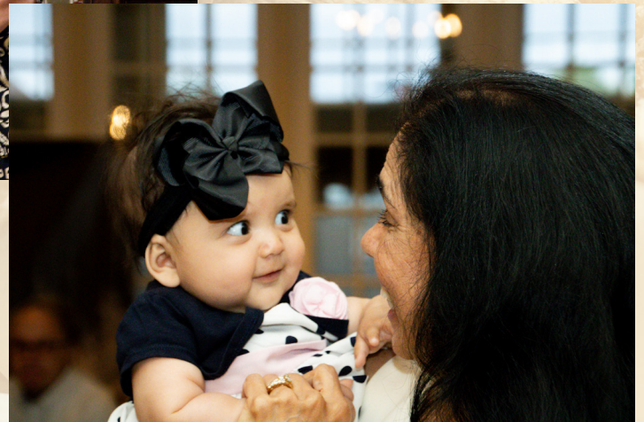
Annual Fundraising Gala