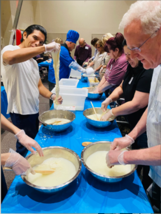
Hands-On Mozzarella Class