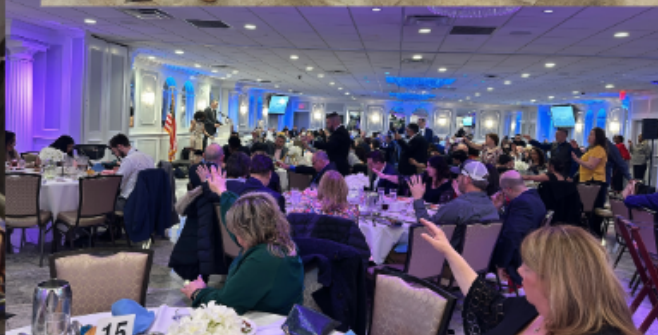
Annual Fundraising Gala