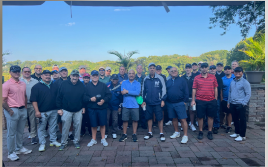
Annual Golf Outing