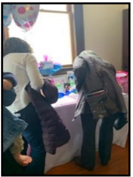
Tottenville Evangelical Free